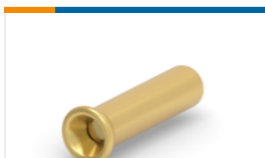
TE Part # 50935-6 SOCKET,MIN-SPR AU-AU SER-1